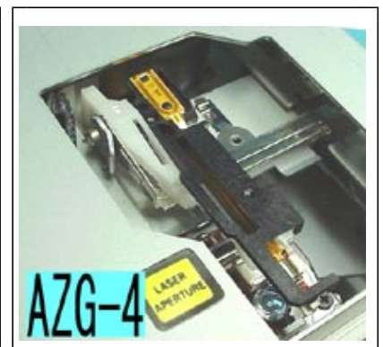
Fig-3. OWH of AZG-4 mechanism