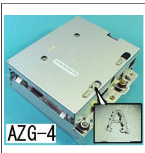
Fig-1. View of AZG-4 mechanism