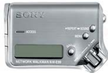
Network Walkman "eNW-E99" Sony style model "(*buriantoshirubah*)"

Sales price:29,800 yen (Price excluding tax:28,381 yen and each carriage) Preceding reservation sales beginning on November 30, 2004 from 13:00